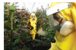
Colombian flower growers struggle to cut pesticides.