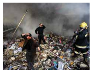
Troops gain little information in recent sweep of car bomb makers.